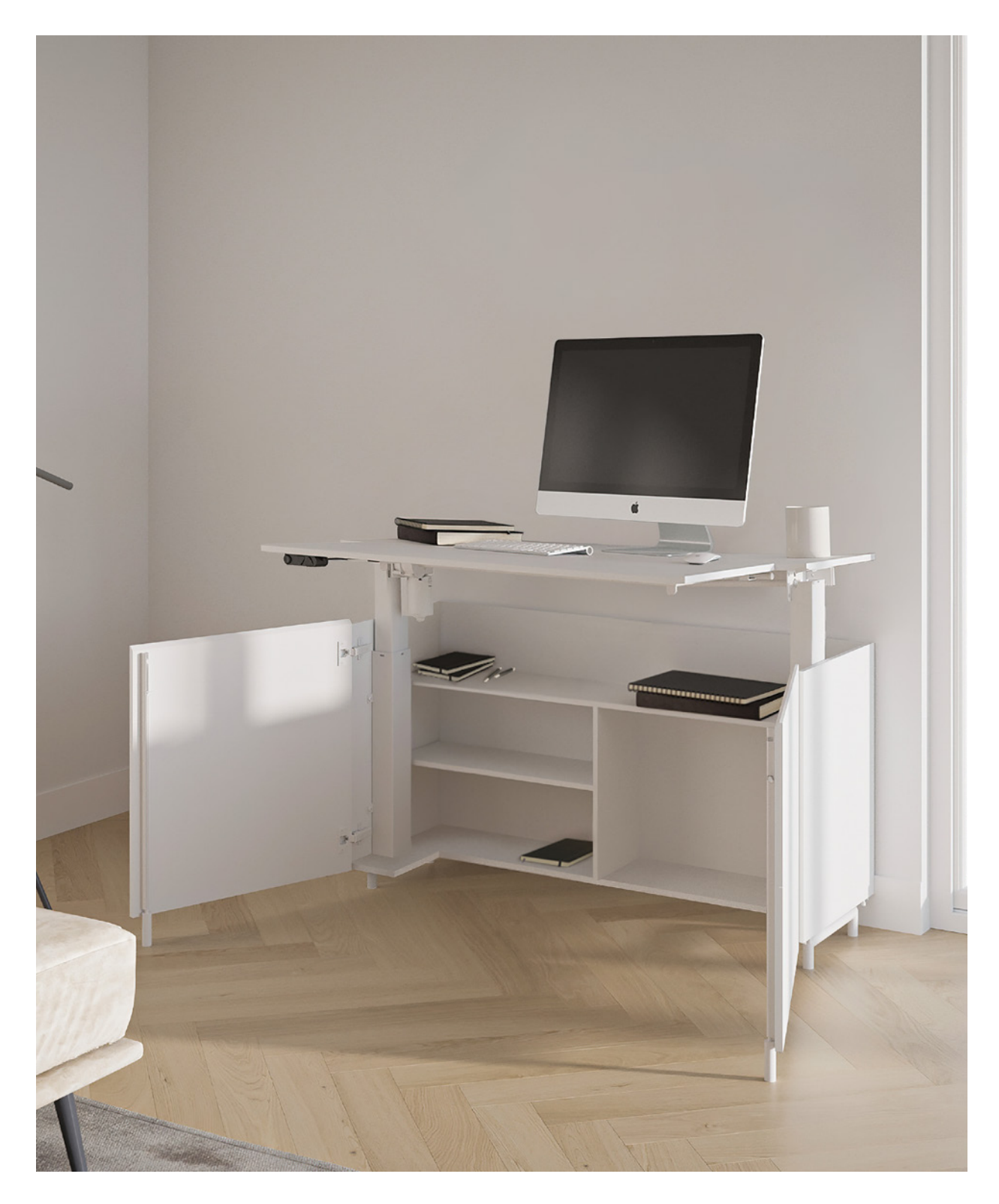
The Cabinet Desk offers a fully adjustable desk solution disguised as a beautiful and minimalistic cabinet.