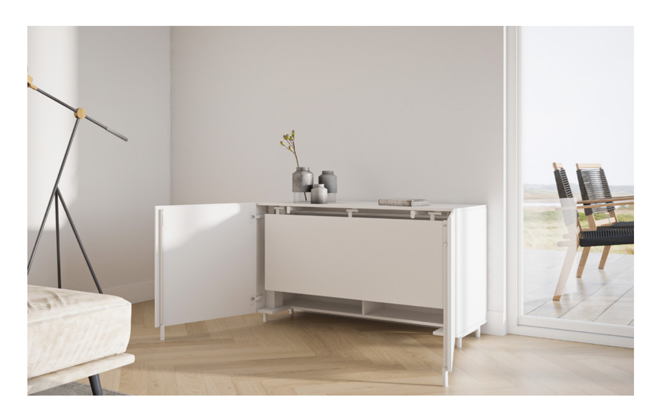
Hide your office when you are not there

Keep your home office materials tucked away in the cabinet when you are not working.