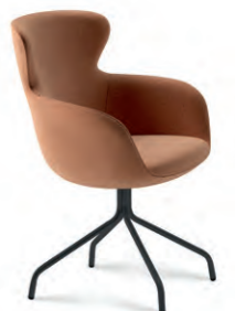
P2 (fissa/fixed) P10 (girevole/swivelling)