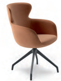
N1/N1R (with castors/ con ruote)