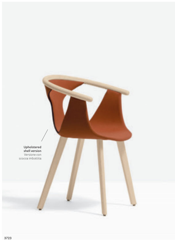
Upholstered shell version Versione con scocca imbottita