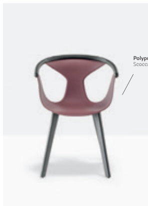
Polypropylene shell Scocca in polipropilene