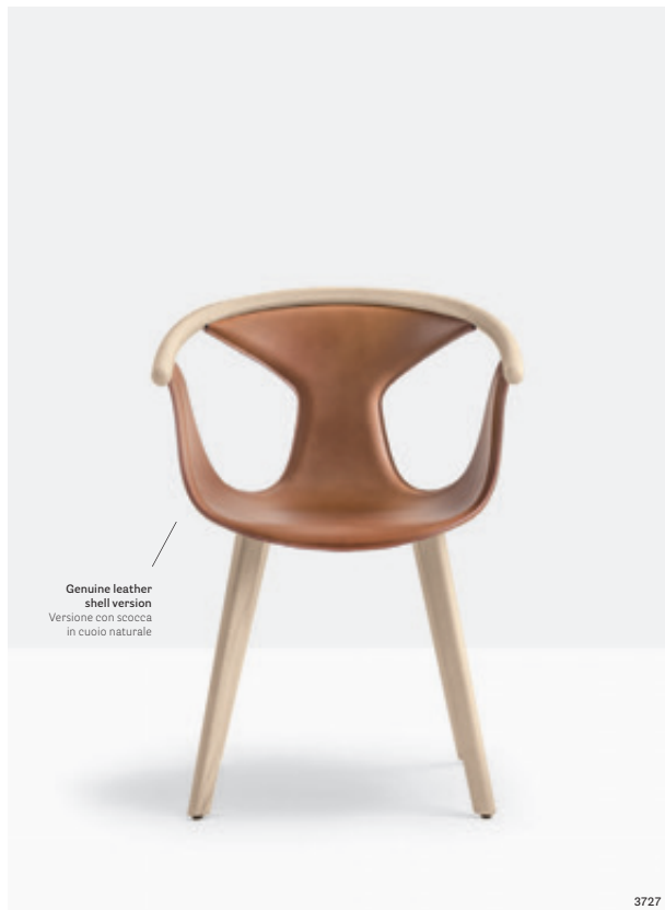
Genuine leather shell version Versione con scocca in cuoio naturale