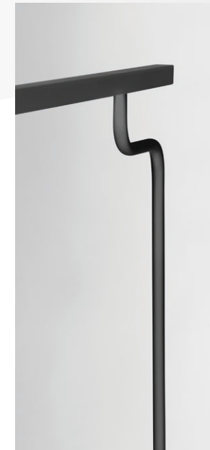
Versione colore nero Black finishing