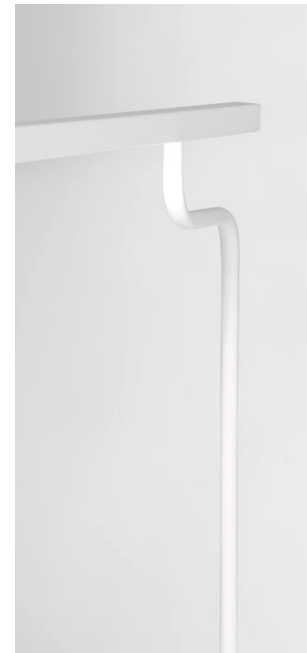
Versione colore bianco White finishing

Lamp LED 10W 10W LED - 4000K 110-240V / 50-60Hz Luminous flux 800 lm