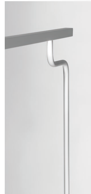
Versione colore grigio-argento Silver-grey finishing