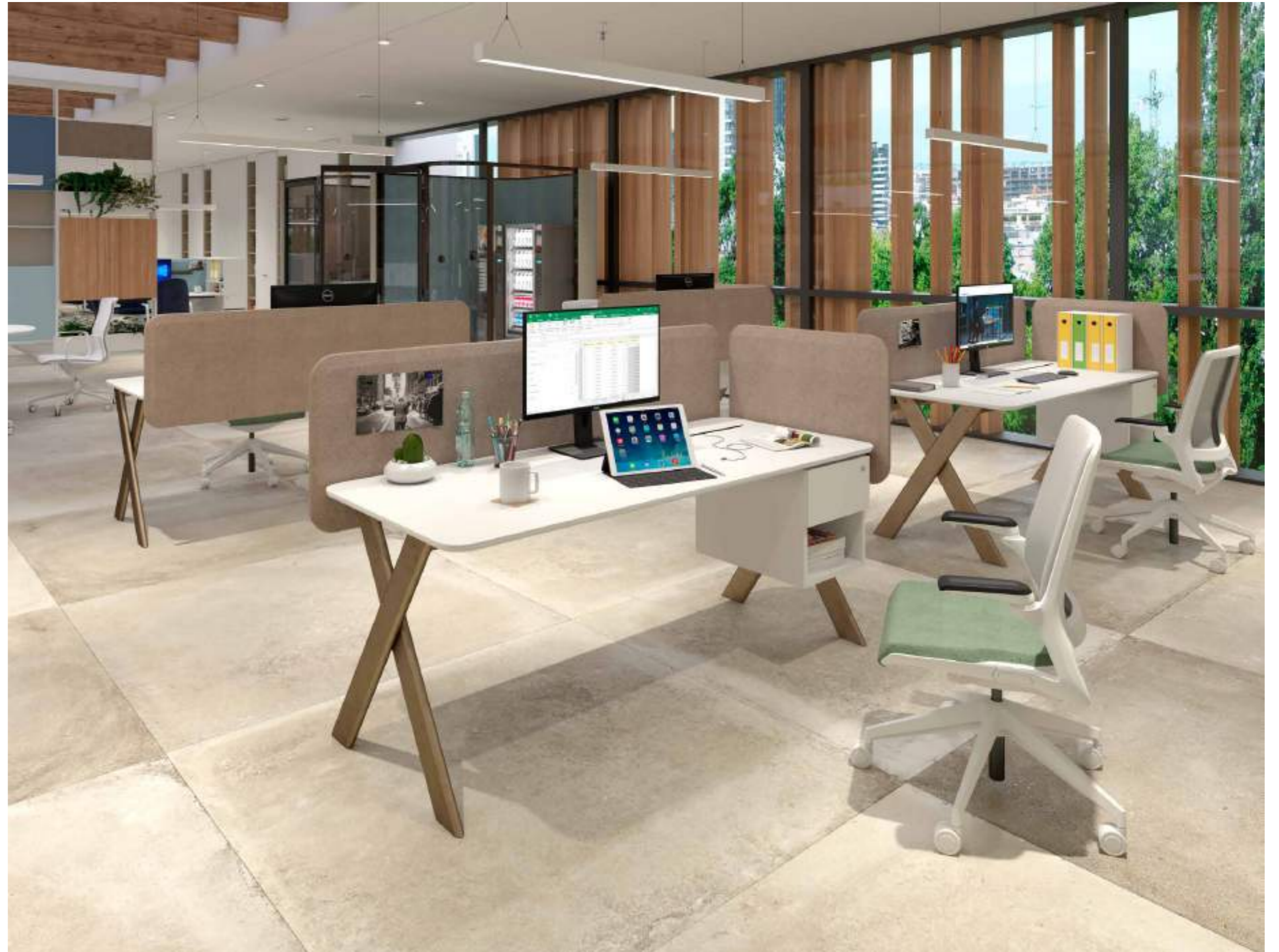
Single desk (180x80 cm) and suspended chest of drawers. Table top in round melamine, 22 mm thick and structure in Bronze std metal. Libra bookcase in floor-to-ceiling configuration. Self operative chairs.