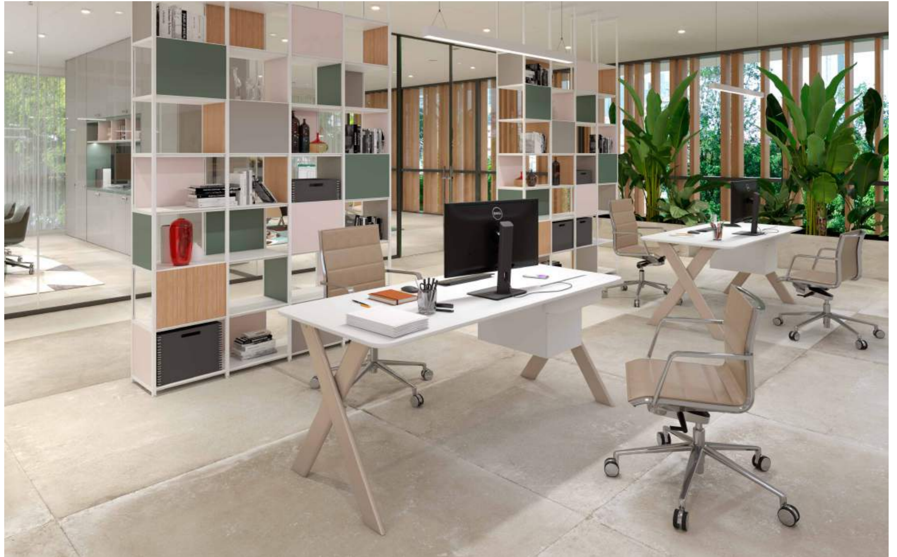
Scrivania singola (180x80 cm) e cassetiera sospesa. Piano in Nobilitato Round sp.22 mm e struttura in metal std peltro. Libreria Libra in configurazione da pavimento a soffitto. Sedie operative e visitatore Alumina.