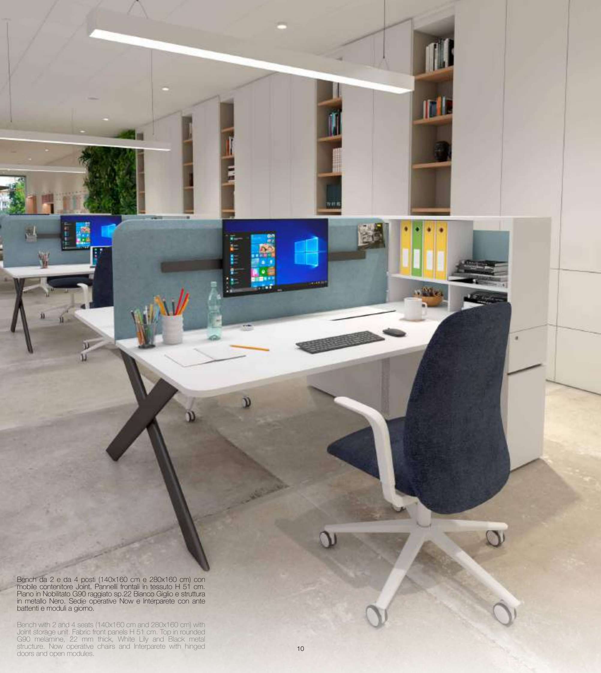
Bench da 2 e da 4 posti (140x160 cm e 280x160 cm) con mobile contenitore Joint. Pannelli frontali in tessuto H 51 cm. Piano in Nobilitato G90 raggato sp.22 Bianco Giglio e struttura in metallo Nero. Sedie operative Now e Interparete con ante battenti e moduli a giorno.