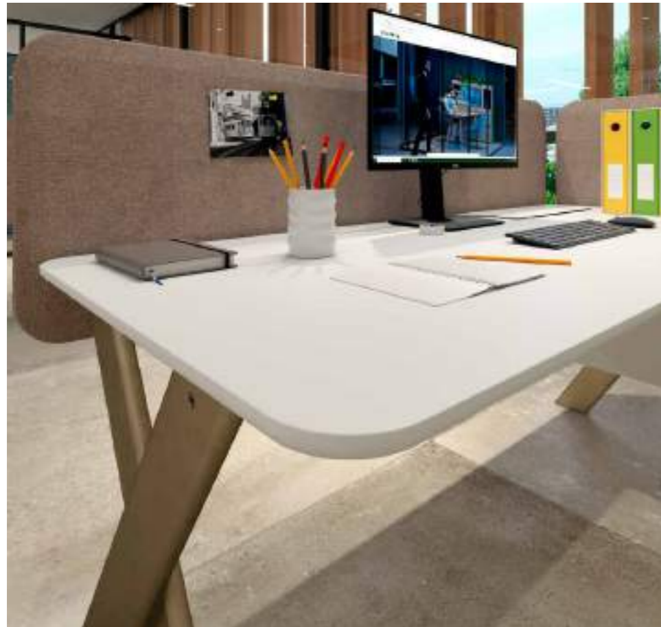
Scrivania singola (180x80 cm) e cassetiera sospesa. Piano in Nobilitato Round sp.22 mm e struttura in metal std bronzo. Libreria Libra in configurazione da pavimento a soffitto. Seduta operativa Self.